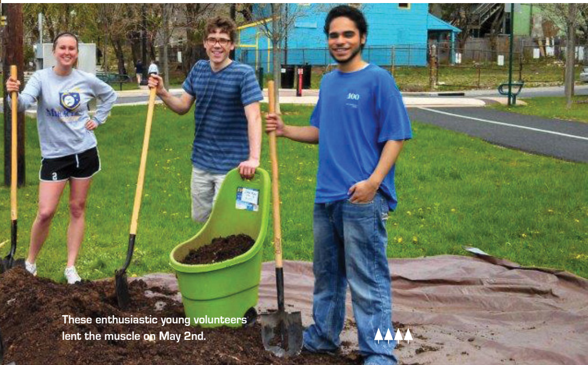
These enthusiastic young volunteers lent the muscle on May 2nd.

Do not sublease your apartment, and do not accommodate boarders and lodgers, or allow long-term guests (more than 14 days). ▲