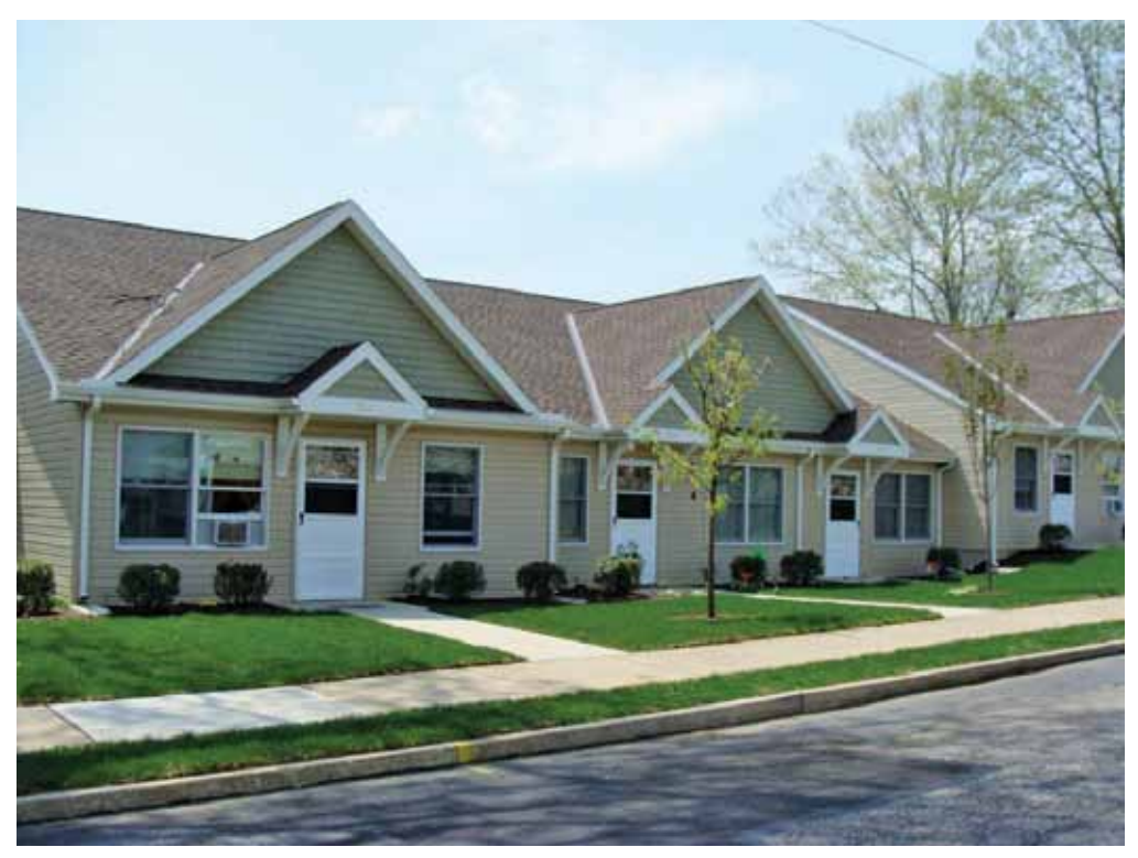
Bayard Homes received finishing touches recently when sod was laid and shrubbery and trees were planted. This photo shows the lovely effect that this has had on the neighborhood as of May.

We have completed replacement of plumbing shut off valves at Monocacy Tower and we are planning to replace house windows in the Marvine section.