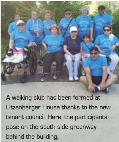
A walking club has been formed at Litzenberger House thanks to the new tenant council. Here, the participants pose on the south side greenway behind the building.

Now that the colder weather is upon us, it's not too late for me to pass along some common sense tips on how to stay comfortable inside your BHA apartment. First, make certain that your windows are tightly closed and latched. This will eliminate drafts from getting inside. Obviously, this is also why your window air conditioner should be removed. When inside on the coldest nights, and after you have set a comfortable temperature, you should wear appropriate clothing. A sweater, socks and slippers and an afghan may be necessary to ward off the bitter chill in the dead of winter. If you think you may have a "no heat" emergency, call maintenance as soon as possible. ▲