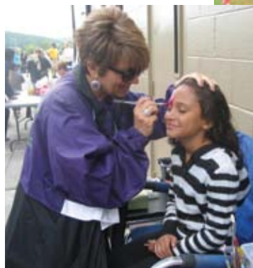
Other activities included face painting, rides and a bike raffle.