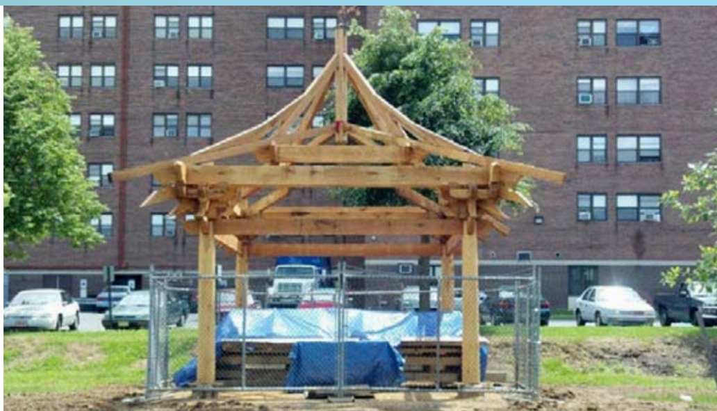
Litzenberger House is the backdrop for the soon to be completed Pavilion along the Greenway.