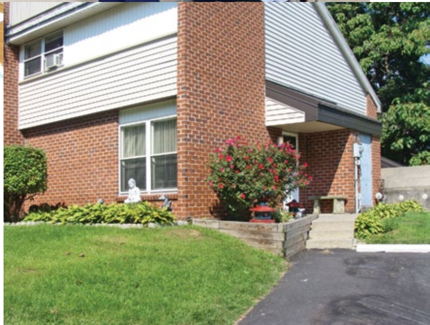
JaviMari Reyes’ front yard is a great example of how a little attention to detail can result in a lovely appearance.