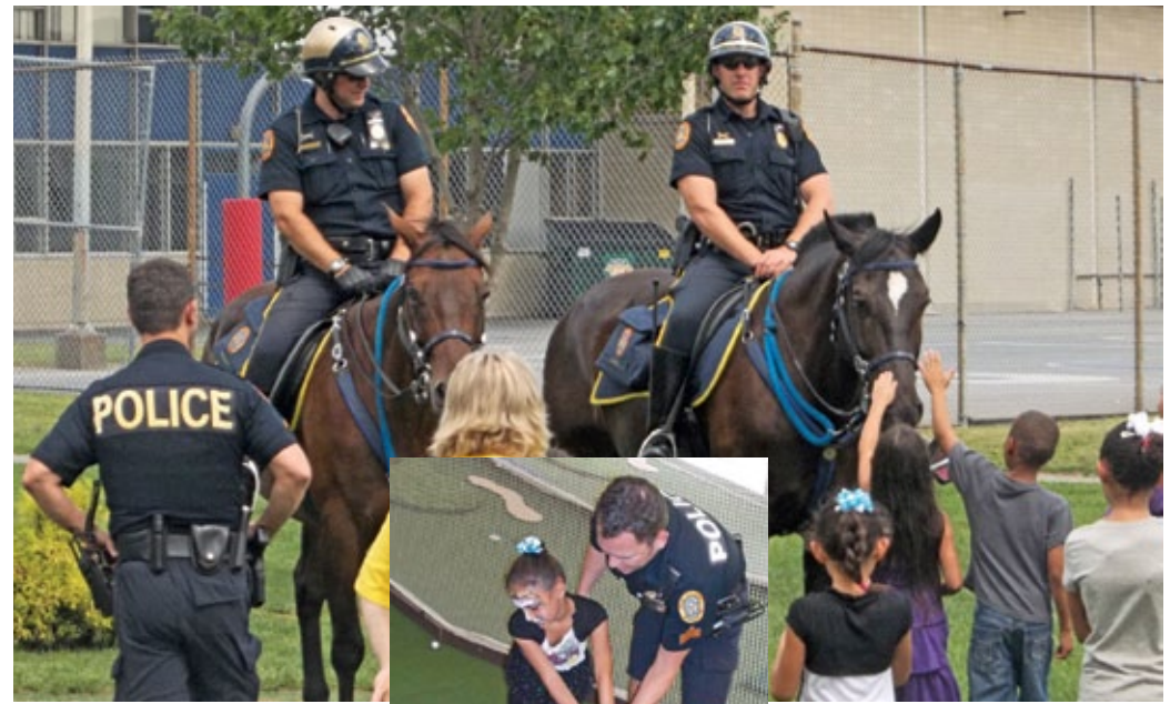
Kids always seem mesmerized by horses. Members of BPD's mounted patrol stopped by to visit at Field Day

F ield Day was a big success, thanks to the efforts of our army of volunteers. The event was held under sunny skies September 8th at the First Tee Center at Marvine. We were able to utilize two basketball courts at the nearby Boy's & Girl's Club, hold bingo in air-conditioned comfort inside the FDO building and also provide some golf instruction at the award winning golf center. The participants also enjoyed free food, beverages, and of course rides, games, face painters and a bike raffle. ▲